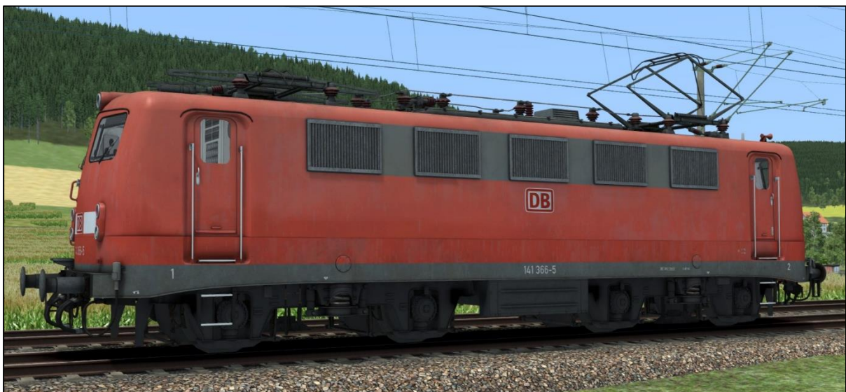
DB BR141 366-5 or dynamic number