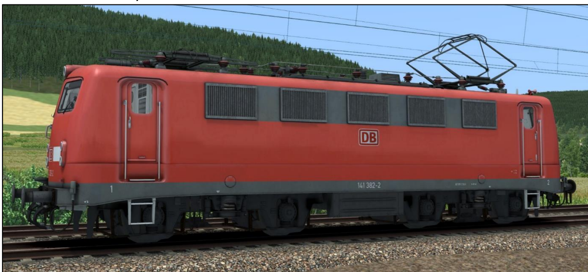
DB BR141 382-2 or dynamic number