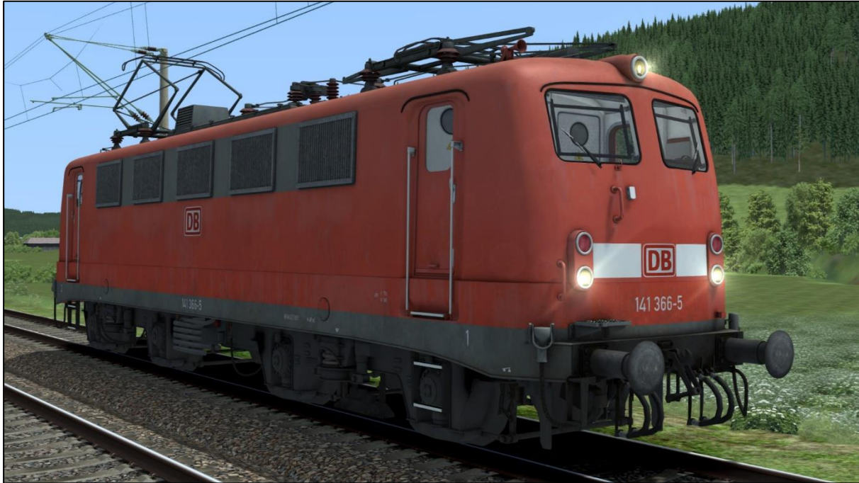
BR141 366-5 traffic red

Compatible with Train Simulator 2017 and later