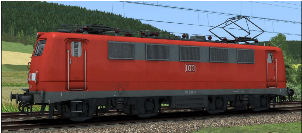
DB BR141 221-2 or dynamic number